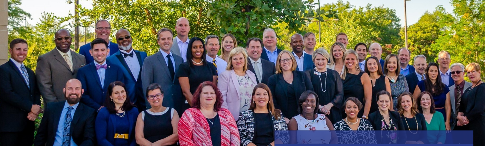
Signature Class 36 Opening Retreat, September 2019